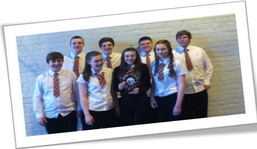
< Champions! The Water Polo Team with their trophy

This year has seen several changes in the S3/4 Water Polo team, with many new faces joining the team at the start of year. Despite this, the squad have shown huge developments in terms of commitment, enthusiasm and determination and succeeded in winning the Active Schools League. Congratulations again to all players.