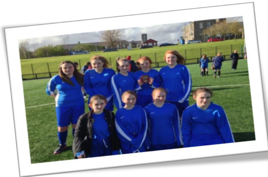
< S1/2 Girls with their plate.

An enthusiastic group of S1-S2 girls attended the Active Schools Football Plate finals winning every game and showcasing their undoubted talents to the many spectators who came along to watch.