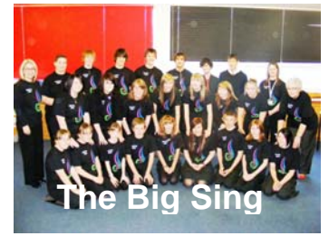
The Big Sing

Congratulations to Dundee Schools' Festival of Music and Arts winners: 4 Gold Awards, 12 Silver Awards & 4 Bronze Awards.